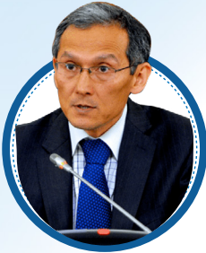
H.E. Djoomart Otorbaev Former Prime Minister of Kyrgyzstan

H.E. Djoomart Otorbaev is now professor of the Belt and Road School, Beijing Normal University. He served as Advisor to the President of Kyrgyzstan (2001), Deputy Prime Minister of Kyrgyzstan for Economics and Investments (2002-2005 & 2011-2012), First Deputy Prime Minister of Kyrgyzstan (2013-2014), and Prime Minister of Kyrgyzstan (2014-2015). He also worked as the Governor from Kyrgyzstan in the World Bank Group, the Asian Development Bank, and the European Bank for Reconstruction and Development (2012-2014).